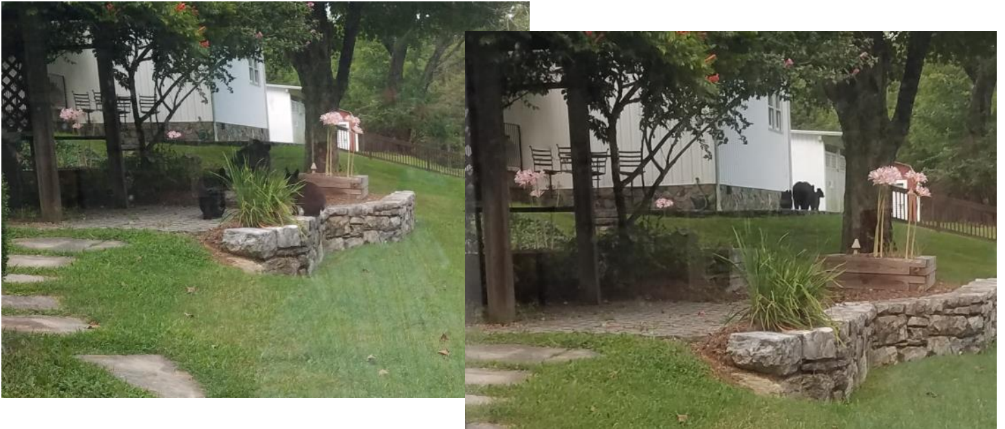
Our neighbors practice social distancing, Covid or no Covid! - Chuck & Carole Geiger -