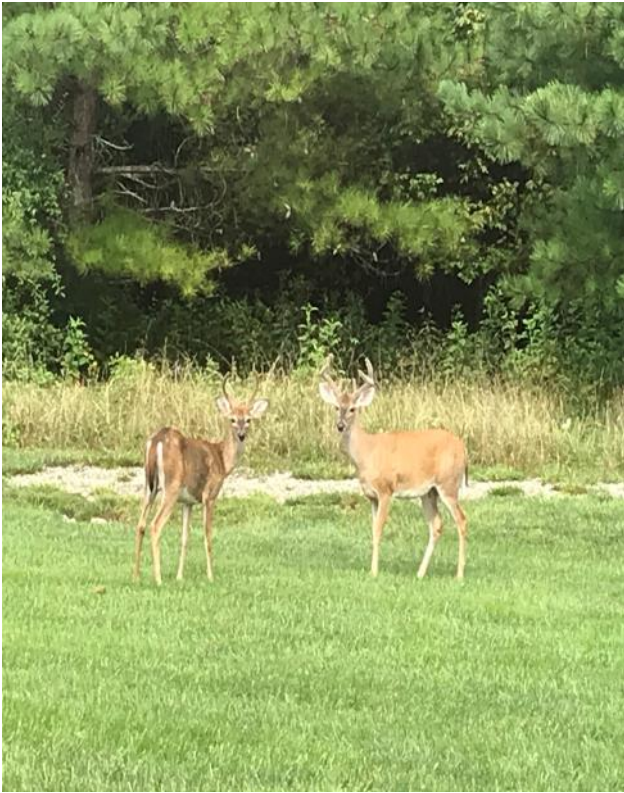
The boys are getting restless!