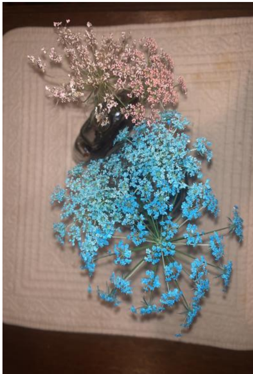
Along with book editing, Ann Layman is also experimenting with food color water to change the color of Queen Ann's lace for educational purposes