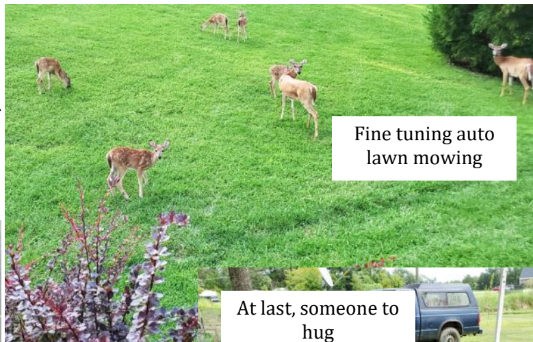
Fine tuning auto lawn mowing