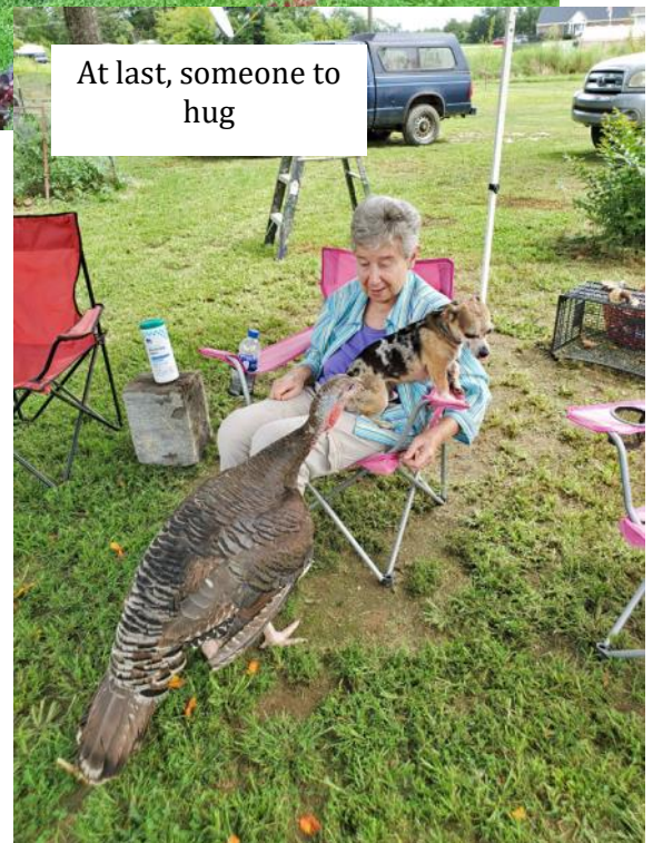
At last, someone to hug